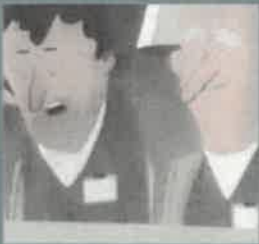
Sound engineers: We do our job in the booth.

Hint 2 – Look at the pictures and examine the attitude of the suspects.