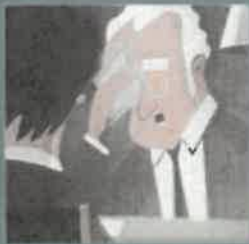
Coach: It doesn't make sense for me to sabotage the team leader.