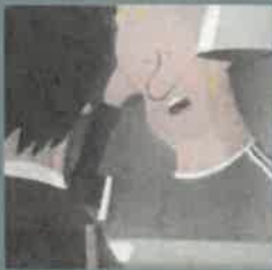
Joe Biggs: I didn't go to the dressing room at all.